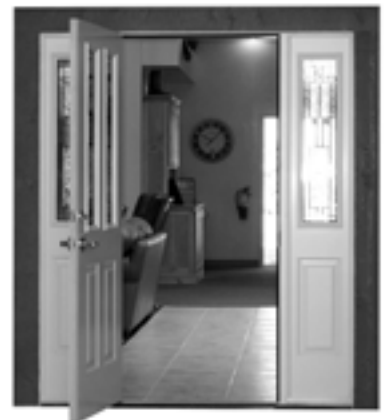
Welcome to Nash House!